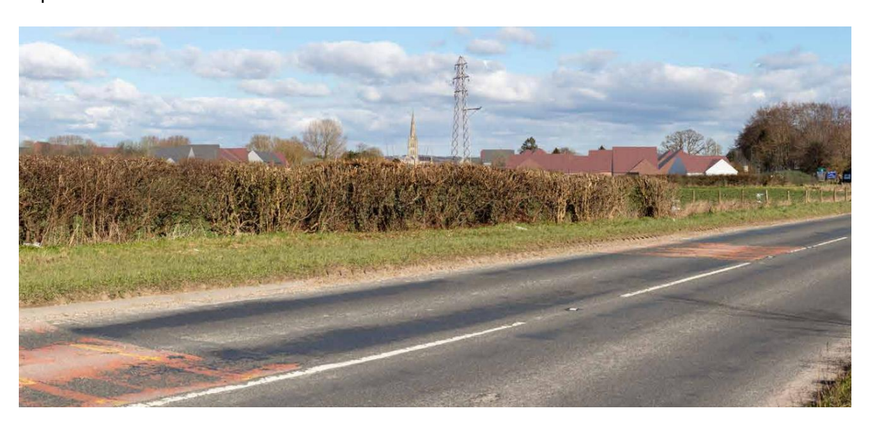
A view of the Cathedral from Netherhampton road with the new dwellings superimposed.

The site has been designed to protect as far as possible the major views of the Cathedral along Netherhampton Road when viewed from the West. There is a large area of open space set aside through the middle of the development to keep views across the site whilst to the west where the development meets the open countryside some of the dwellings have been kept at a lower level in order to ensure that views remain of the Cathedral.