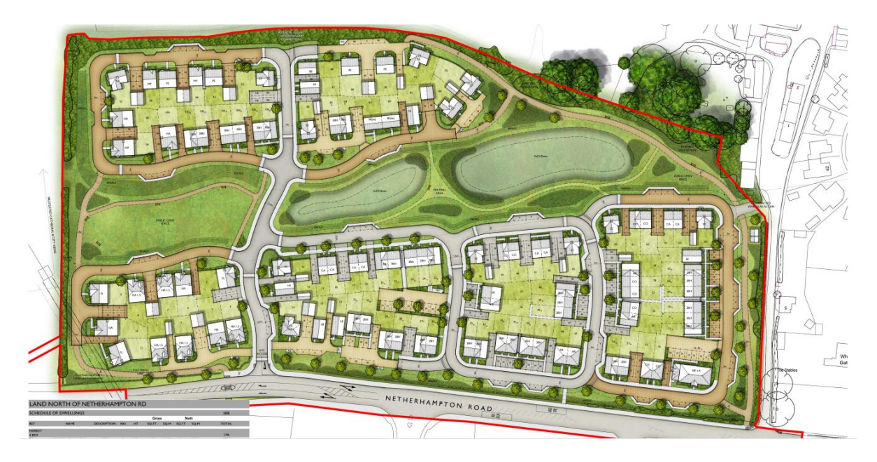
The main site layout

The layout shows an area of green space through the site which would maintain in part the existing views off the Cathedral that can be seen from the site. Housing on the western edge of the site would be single storey rising up across the site to two storey adjacent to the existing edge of development in Harnham.